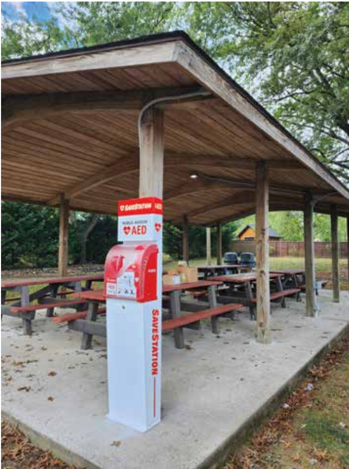
AED SaveStation installed at the pavilion at the Highland Park Playground